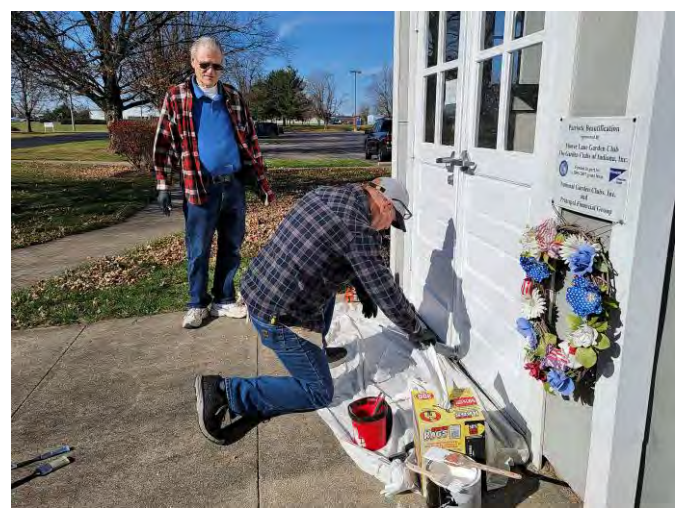
Minor repairs were made to the 80-year old chapel building. Additional work will be needed in 2023.

The fluorescent ceiling lights were replaced with LED bulbs. This was done to save money and to protect the artifacts on display. LEDs do not emit harmful UV light.