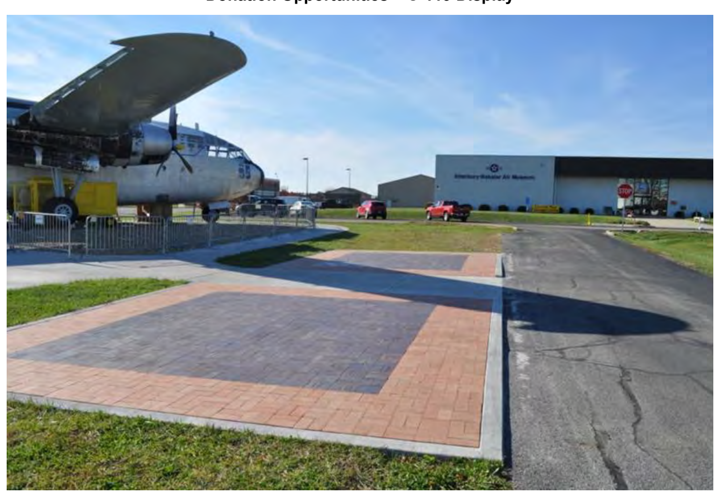
Donation Opportunities – C-119 Display

When The Charlie 119 Project began in 2019, engraved bricks were offered as an incentive for donations. All the bricks we received donations for have been installed, however, there is still space available for more engraved bricks and there is a need for donations to continue the project through its last stages. Below are the incentives for various donation amounts. The following pages contain the engraved brick and T-shirt order forms.