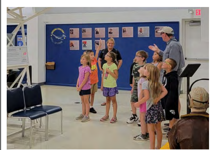
A field trip for children from the Country Kids Day Care.