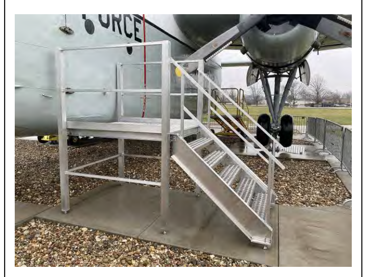
The temporary, wooden, stairs were replaced with permanent aluminum stairs. These stairs were constructed by Central Sheet Metal of Columbus.