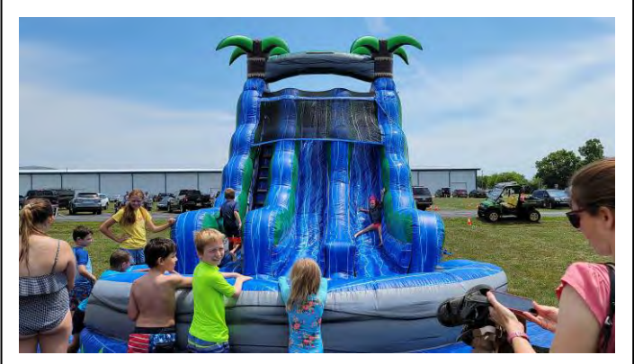
Three different water slides were available.

Saturday, July 23, the first Splash Bash event was held at the airport. The event was intended to bring families to the airport for some water based fun.