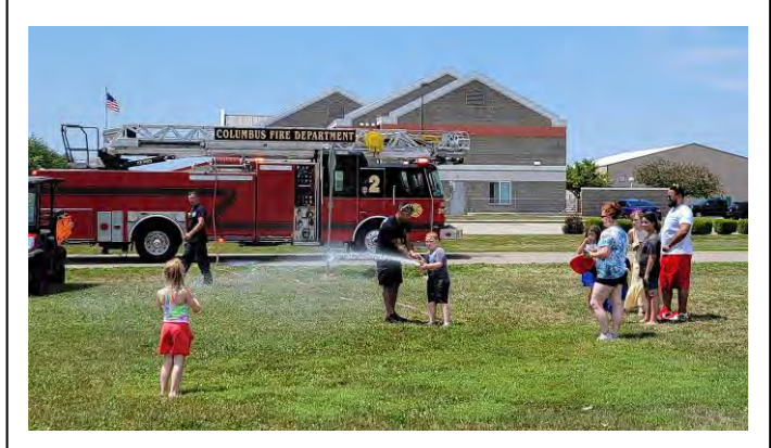
The Columbus Fire Department was on hand.