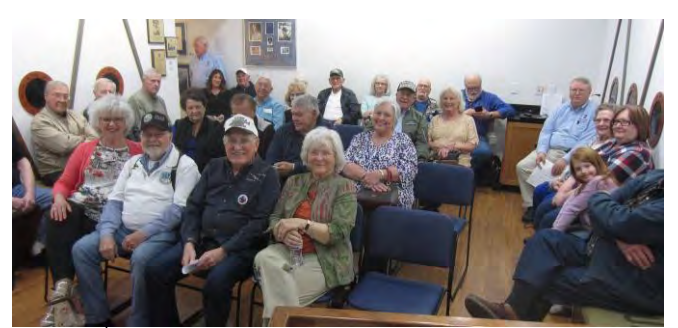
The 71<sup>st</sup> SOS veterans have always been loyal supporters of the museum. They have also provided a great deal of help with the restoration of Charlie 119.

The 434<sup>th</sup> Tactical Airlift Wing was stationed at the air base from 1949-1970. In 1968 one of the two squadrons was recalled to active service for duty in Vietnam. About 300 reservists from the Columbus area deployed to Vietnam in 1968 and returned in 1969. Ever since then these veterans have held a reunion at the museum once or twice a year.