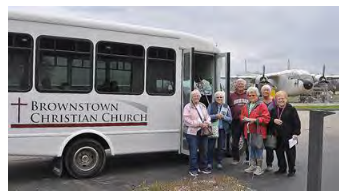
The museum is visited by a great variety of tour groups. Here is a group organized by a church.