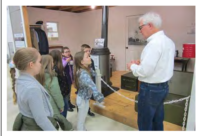
One of the 4<sup>th</sup> grade students from Schmitt Elementary School, Columbus asks a question.

With the easing of COVID restrictions, many schools, and other organizations, have resumed organizing tours of the museum.