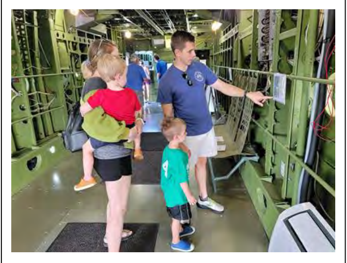
Signs explained some of the unusual features of a military transport, and museum volunteers were available to answer questions.

The interior of the airplane was open to visitors.