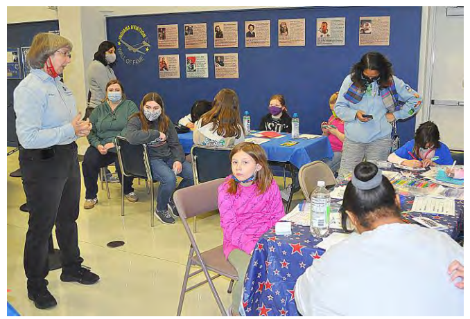
A Troop of Girl Scouts visited the museum to learn about the history of the airport. Afterwards they made some Thank-You cards that they gave to veterans.

The local MOPS (Mothers Of PreSchoolers) group stops by the museum once or twice a year. The Media Center has some cartoons on hand for the little ones.