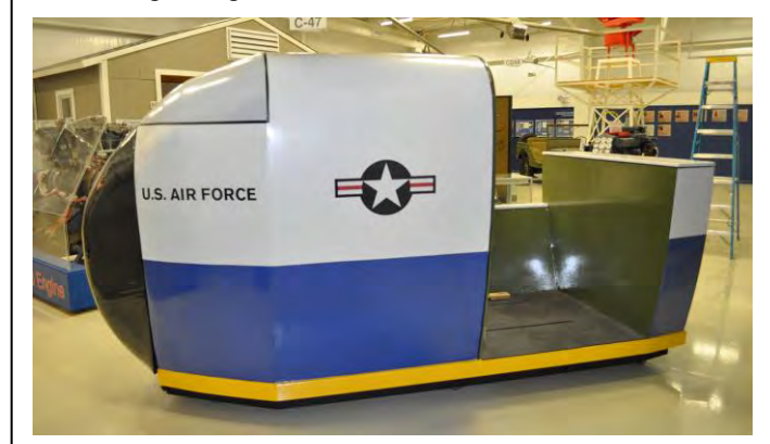
The flight trainer has been completed. Museum volunteers are now being trained in operating it.

Some volunteers are building a 1/8 scale B-26 bomber. When completed, this airplane will be suspended from the ceiling along with the other aircraft models.