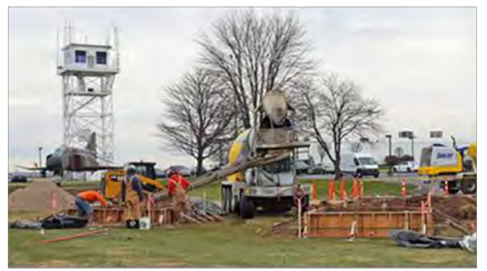
Force Construction Company built the display site.