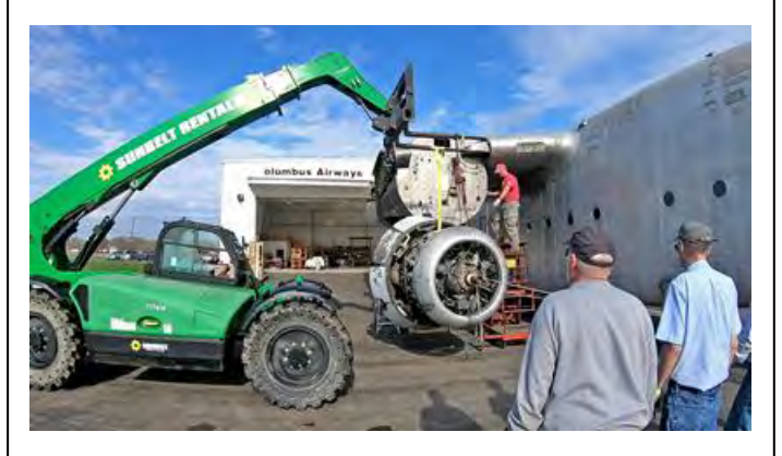
Charlie 119 was towed out of the hanger in the spring and the various restored components were reassembled.