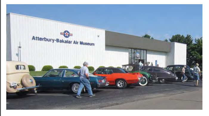
The Grand Indiana Auto Tour stopped by the museum.