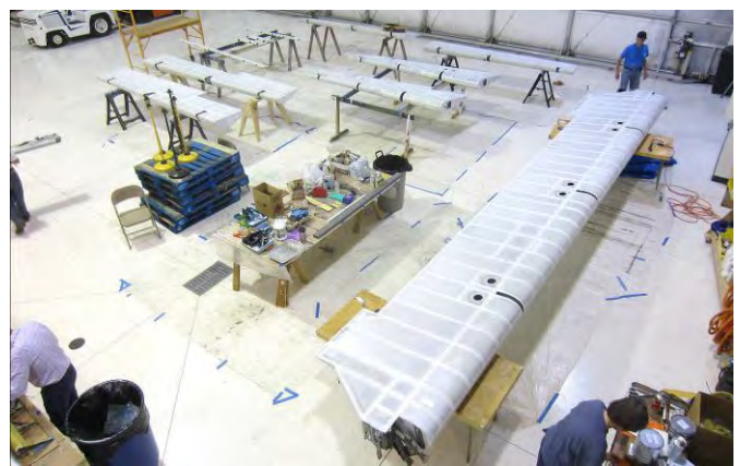
One thousand square feet of fabric was needed to resurface all of the control surfaces.