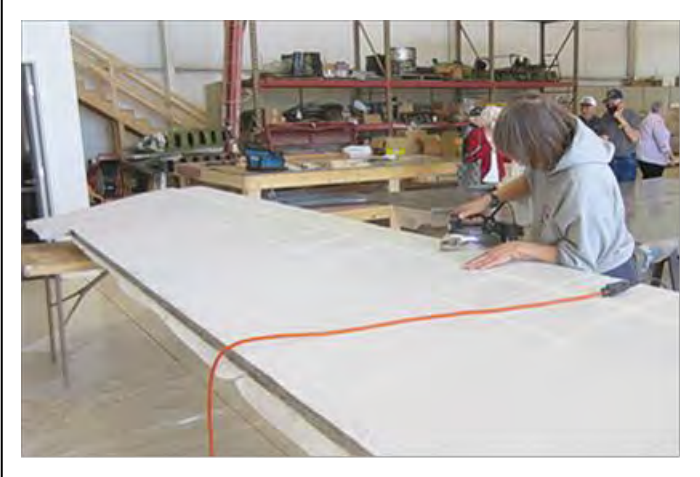
After the fabric was glued and riveted to the aluminum frame, heat was applied to shrink the fabric. This gave it a smooth, tight surface.

All of the fabric covered flight control surfaces (rudder, ailerons, trim tabs) had to be stripped, cleaned, and recovered. The rivets, and all sharp edges of the aluminum framework, were first covered with 1,900 feet of cloth tape.