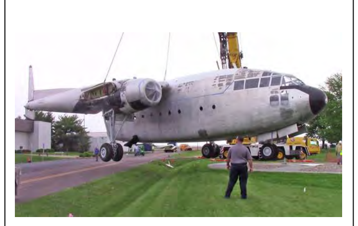
Charlie 119 is airborne for one final trip.

On the morning of May 18<sup>th</sup>, a very large crane from R.H. Marlin, Inc. was used to move Charlie 119 the final 100 feet to the display site. Three steel supports for the landing gear were embedded in concrete. The airplane had to be positioned precisely over these supports.