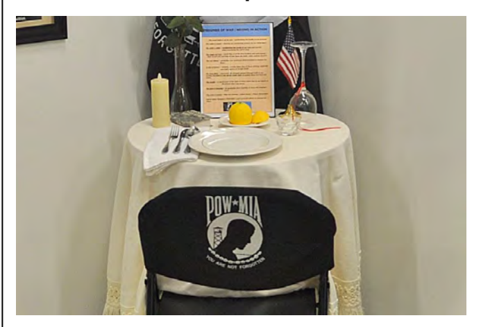
A display honoring POWs and MIAs has been added.