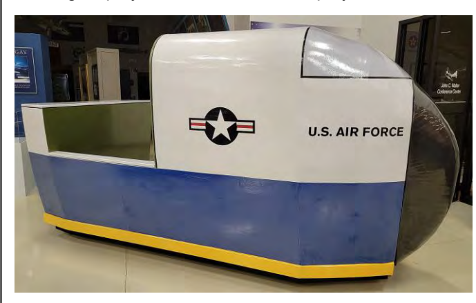
Work on the flight simulator is almost completed.

The museum is closed during the winter months to allow the museum volunteers to clean and repair existing displays and to build new displays.