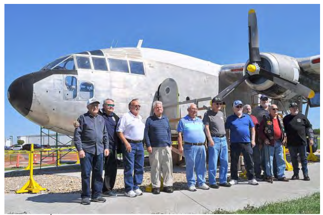
The 71<sup>st</sup> SOS veterans have always been loyal supporters of the museum. They have also provided a great deal of help with the restoration of Charlie 119.

The 434<sup>th</sup> Tactical Airlift Wing was stationed at the Columbus Airport from 1949-1970. In 1968 one of the two squadrons was recalled to active service for duty in Vietnam. About 300 reservists from the Columbus area deployed to Vietnam in 1968 and returned in 1969. Ever since then these veterans have held a reunion at the museum once or twice a year.