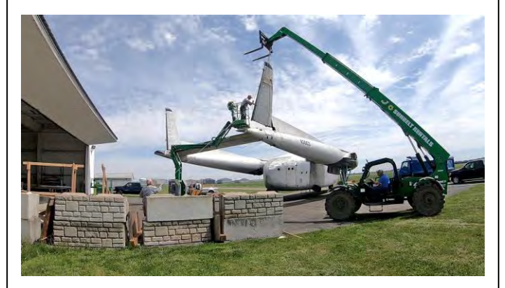
The assembly effort required the use of lifting equipment. Much of the equipment used by the team was provided by Sunbelt Rentals.