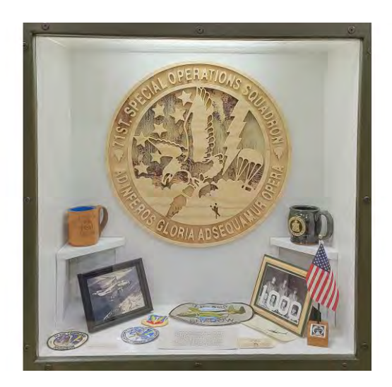
One of the 71<sup>st</sup> SOS displays at the museum was upgraded this year. A wooden plaque was added which is modeled after the squadron patch. Two 71<sup>st</sup> SOS coffee mugs were also added to the display

Atterbury-Bakalar Air Museum, Inc. 4742 Ray Boll Boulevard Columbus, Indiana 47203 Phone 812.372.4356 atterburybakalarairmuseum.org