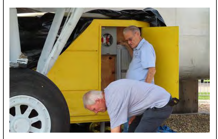
A new electric power line to Charlie 119 was installed by Duke Energy. An HVAC system was installed to heat and cool the interior of the airplane.