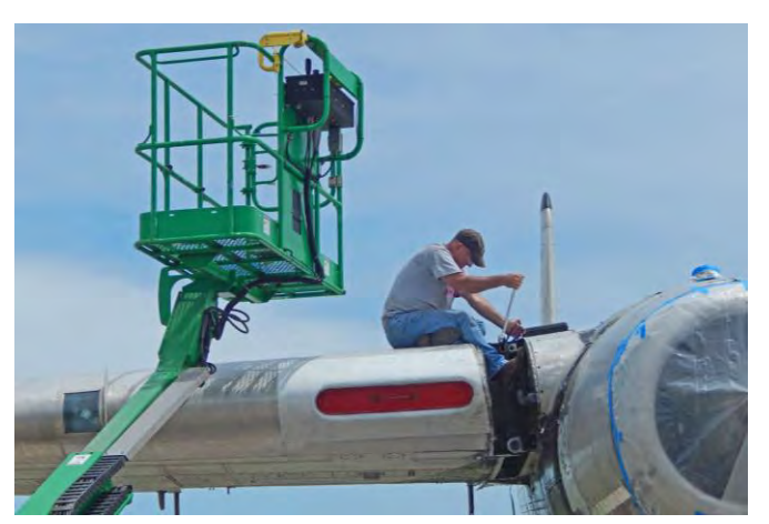
The wings, propellers, and rudders were then attached.

After Charlie 119 was permanently bolted to the display site, the restoration work continued.