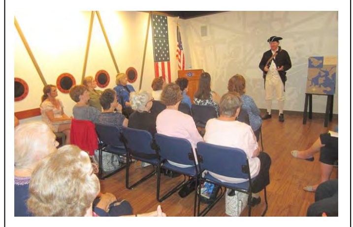
The Columbus Chapter of The Daughters of the American Revolution (DAR) used the Media Center for two of their monthly meetings.