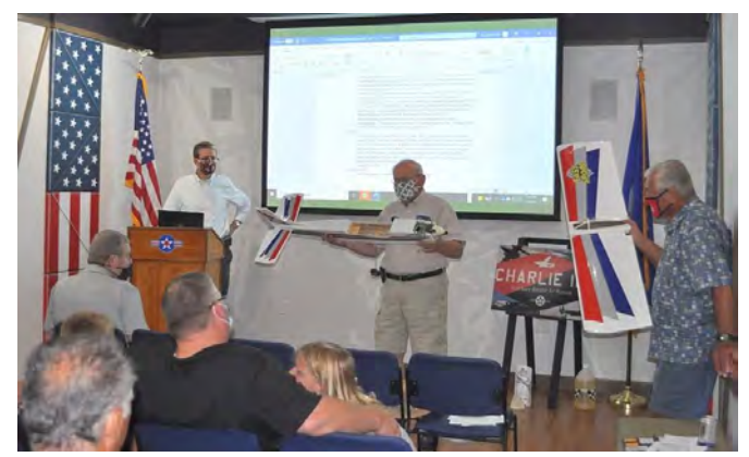
The Bartholomew County Radio Control Fliers used the museum's Media Center to hold their meeting.