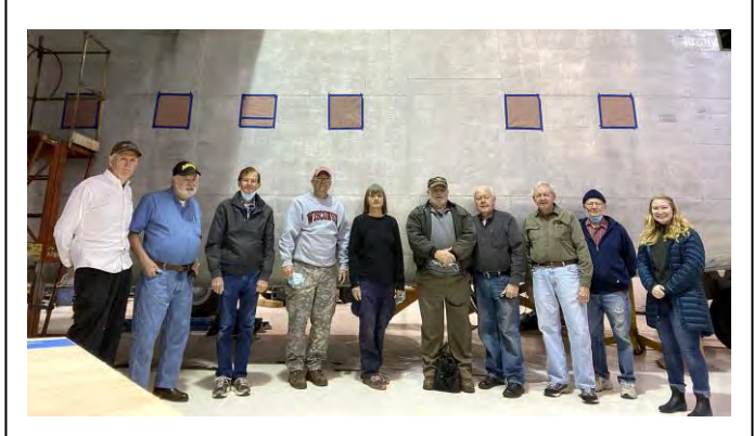
The Charlie 119 Restoration Team (Note: some valued members are not in this photo)

The commemorative bricks that were purchased by donors will be added to the site in the spring.