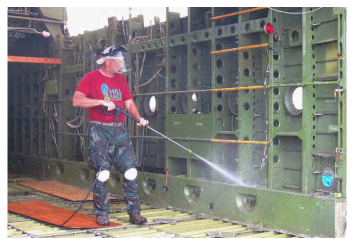
Throughout the restoration process every part was cleaned, and then cleaned again.