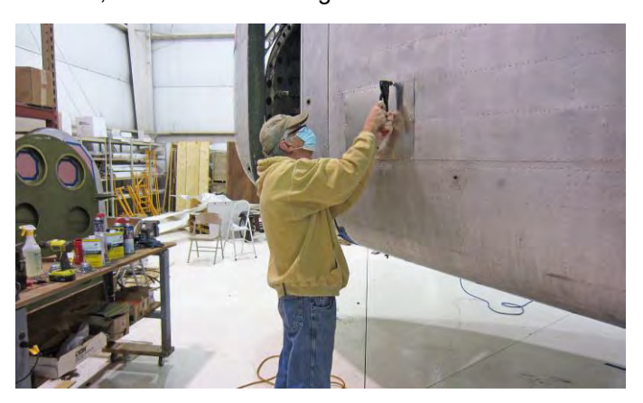
Damaged or missing parts were repaired or replaced. The windows in the cockpit and fuselage were degraded and had to be replaced.