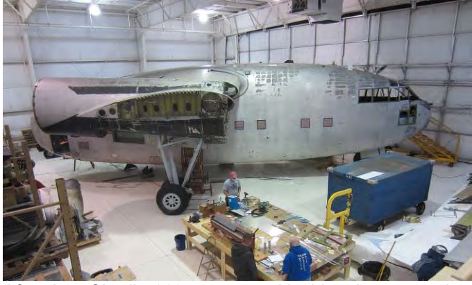
After that, Charlie 119 was moved inside a hangar and the slow, careful, restoration work began.

The first priority, after all of the components were on hand, was cleaning. The airplane had been sitting in the desert for 29 years. On August 11 the reassembly process began when the fuselage and wing box were joined.