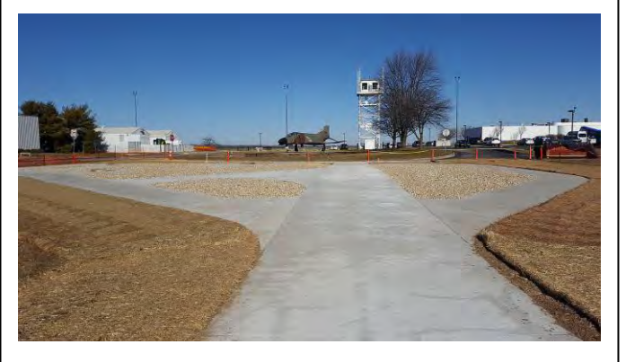
The display site for Charlie 119 has been completed. The work was done by Force Construction, Inc.