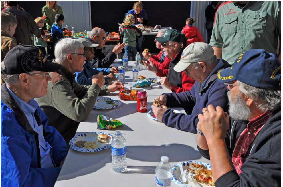
A table of well-fed Veterans.