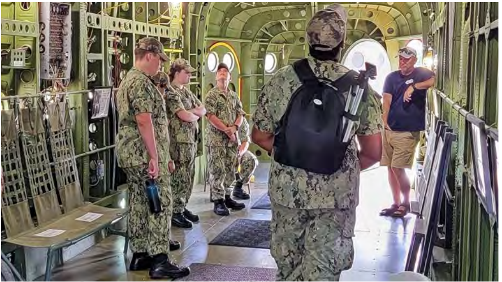
A group of Sea Scouts visited in August.