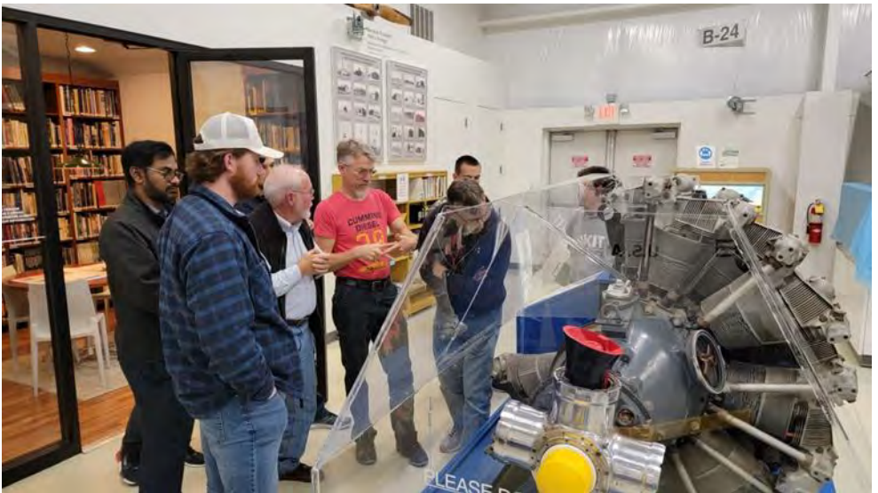
A team of young engineers from the Cummins plant in Seymour visited the museum in October. They spent a great deal of their time discussing our cutaway engine. It is a Wright R-3350 engine which was used by the C-119 among many other airplanes.