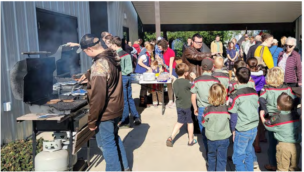
Trail Life Troop 110 served lunch to veterans on the museum patio.